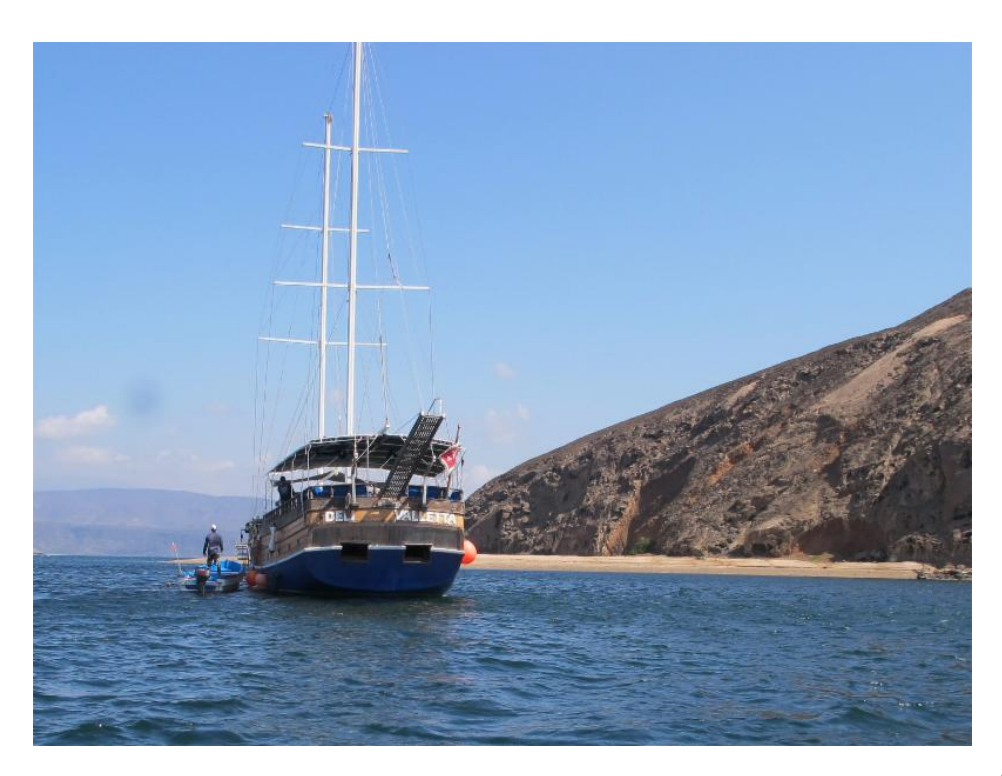
Live aboard this Turkish gulet while volunteering on a whale shark research study.

all visitors and increasing by 4 percentage points compared to 2016-2017. Australian, German and British visitors were the next most enthusiastic visitor nationalities, accounting for 11%, 7% and 7% respectively.