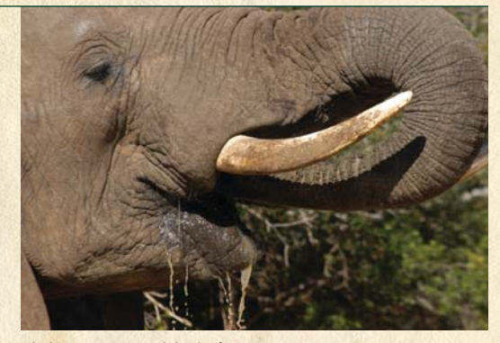
Elephant enjoys a cool drink of water

Terrie and her team also traveled with gallons of water that nearly reached the boiling point on the overheated floor of their 4x4 vehicle as it bumped along the sandy tracks of the Khaudom Game Reserve. The lone warden told them that local water holes were drying up and that the elephants were increasingly thirsty, when the unexpected occurred: