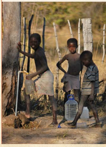
Elephants aren't the only ones needing water in dry northern Namibia. Here three young boys collect water for their families from a community spigot. Children may have to walk miles to retrieve potable drinking water

To understand competition for fresh water resources between wildlife and humans