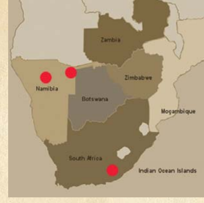
Terrie's study areas in southern Africa

In the following days Terrie's team watched herds of elephants and spoke with local people as they all searched for water. With changing climates and increasingly tight borders around lands, humans and animals are both fac-